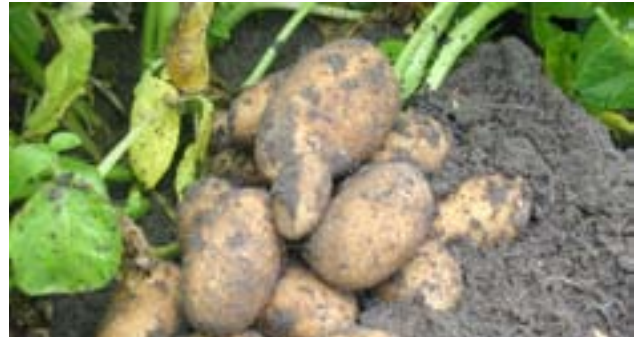
The Korean DVD will focus heavily on Grant County's agricultural sector