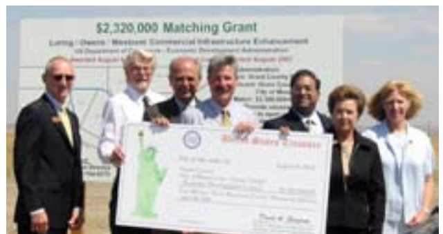
Infrastructure enhancements were completed along Loring, Owen, and Westover Drives