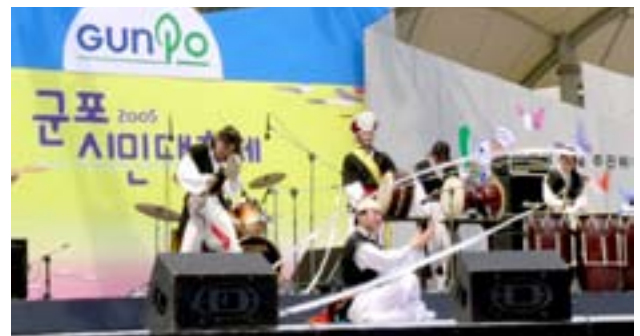
Delegates from Grant County enjoyed a five day stay in Gunpo City, South Korea