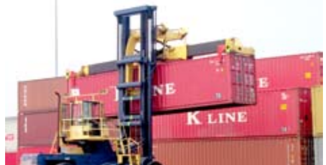
The Inland Intermodal Facility has the capacity to move 4,000 containers a day