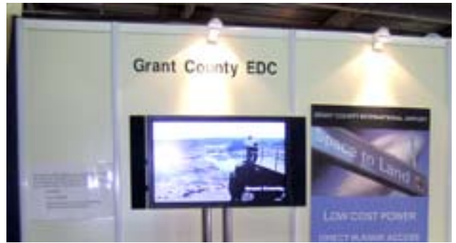
Display at the Paris AirShow in France

In a final look back, the EDC responded to 42 requests for proposals this year and from those proposals we are working on projects with fifteen clients. The EDC is hoping to have announcements on some of these projects in early 2006.