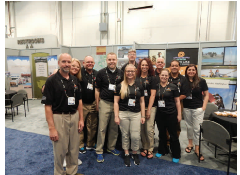
The Grant County delegation to RECon 2014