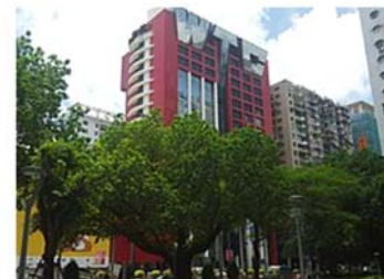
World Trade Center Macau, China