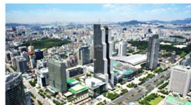
Soul, South Korea