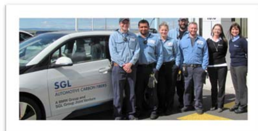
SGL Composite Employees who benefited from the WorkStart Grant.

Initiative I: Existing Business Development. In 2014 and 2015 the Grant County EDC worked with SGL Automotive Carbon Fiber on a Washington WorkStart grant, which